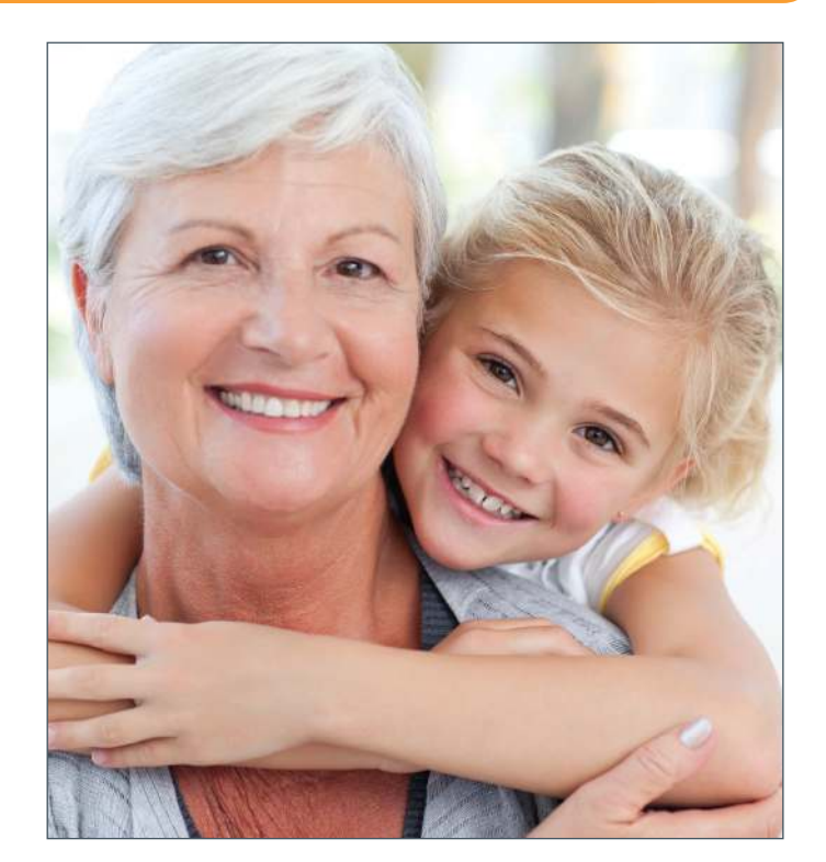
"I thought the process of choosing a stairlift was going to be difficult, but I was wrong. Handicare offers a variety of colors and styles, so I was able to get exactly what I wanted."

You don't have to worry. A Handicare stairlift offers you a safe and reliable solution. Our team of experts have assisted thousands of people in overcoming problems posed by going up and down their stairs. We have many models of lifts to accommodate your needs, and a certified engineer will install your stairlift usually in a couple of hours. So you will have the safety and comfort you need to keep your independence and live in your home free from worry.