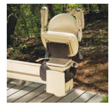
Flip up arms, seat and footrest create plenty of extra space on steps.