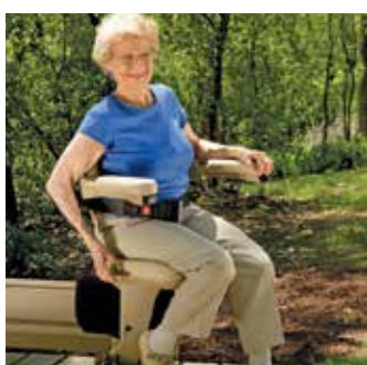
Offset swivel seat makes getting on/off easy.