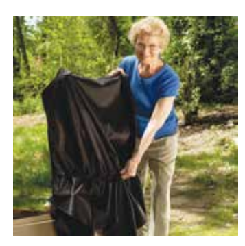
Weather-resistant cover provides durable protection.