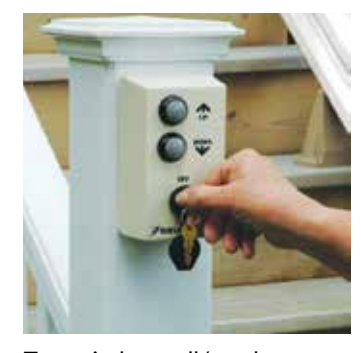
Two wireless call/send controls.