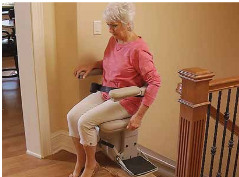
Offset swivel seat makes it easy to get on/off.

"The Bruno stairlift has eliminated an enormous amount of anxiety and stress. We feel grateful for it every day."