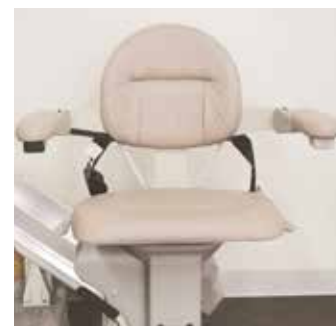
Larger seat and footrest for increased comfort.