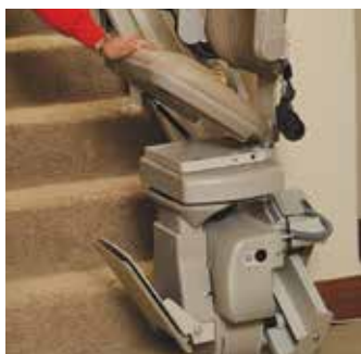
Power folding footrest automatically flips up/down when seat is raised/ lowered.