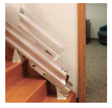
Power or manual folding rail for narrow hallway or when doorway is at the bottom of stairs. Manual operation or push button automatic.