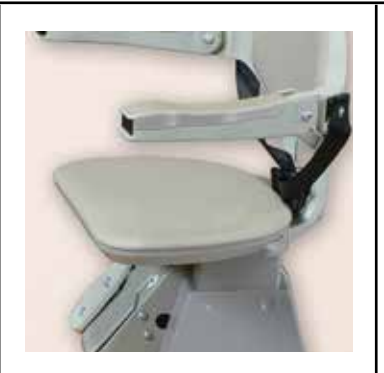
Power swivel seat for effortless exit. Armrest switch control or wireless call/send.