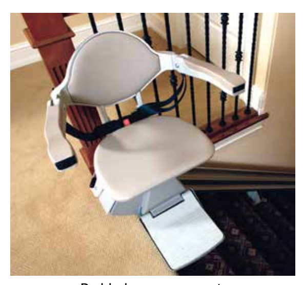
Padded, generous seat.