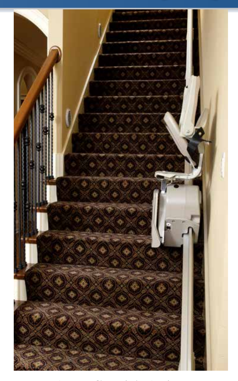
Compact, flip-up design for plenty of open space on stairway.

"Staff was very professional and helpful. The chair is wonderful and I will recommend the product and company."