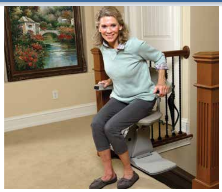
Offset swivel seat makes getting on/off easy.