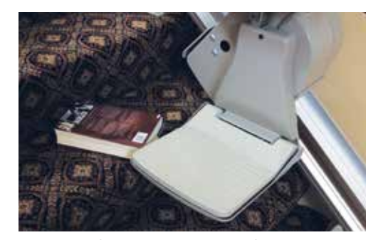
Sensors ensure safety.