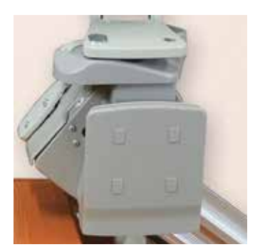
Power folding footrest automatically flips up/down when seat is raised/lowered. Arm switch control optional.