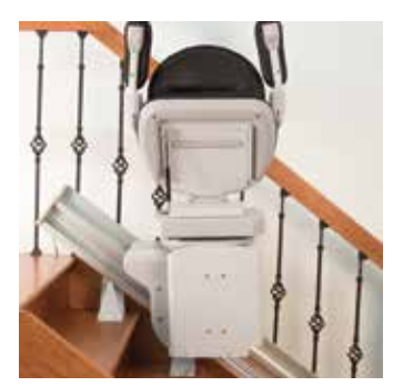
Power folding footrest automatically flips up/ down when seat is raised/ lowered.