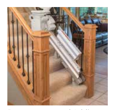
Power or manual folding rails for narrow hallway or when doorway is at the bottom of stairs.