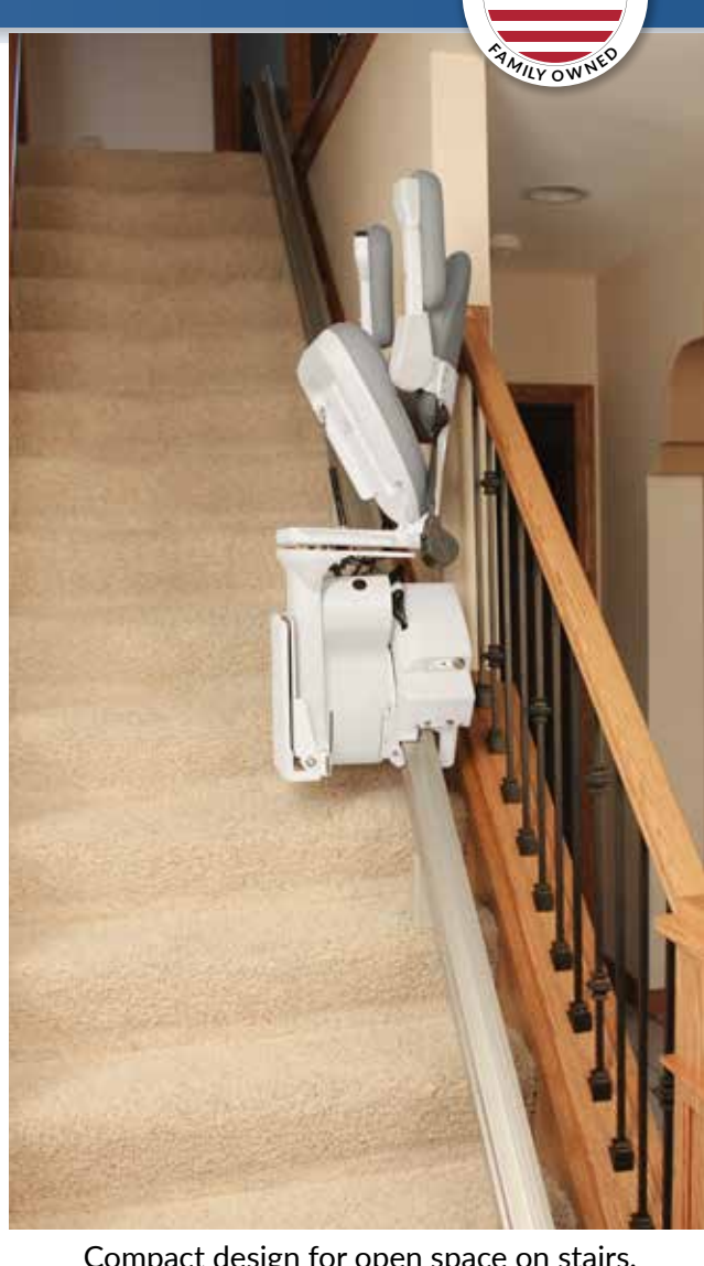
Compact design for open space on stairs.