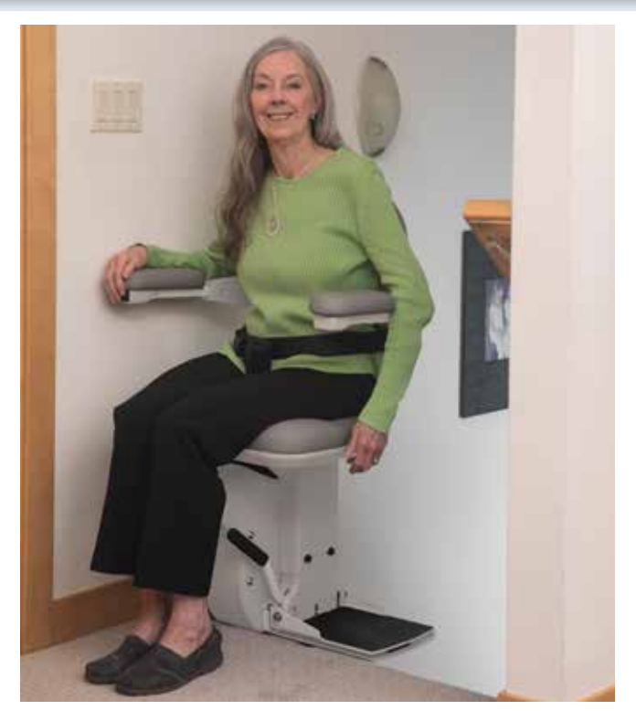
Offset swivel seat makes it easy to get on/off.