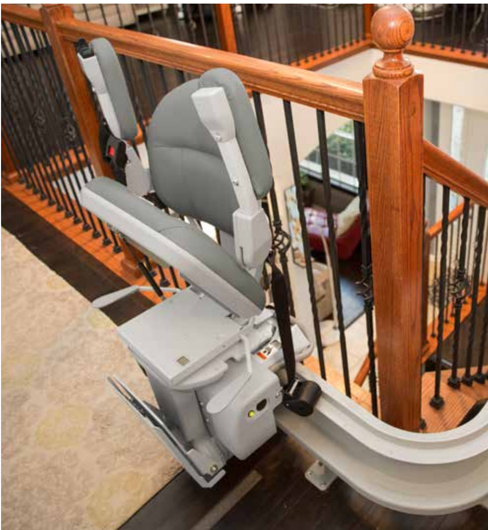
Custom made specifically for your home.