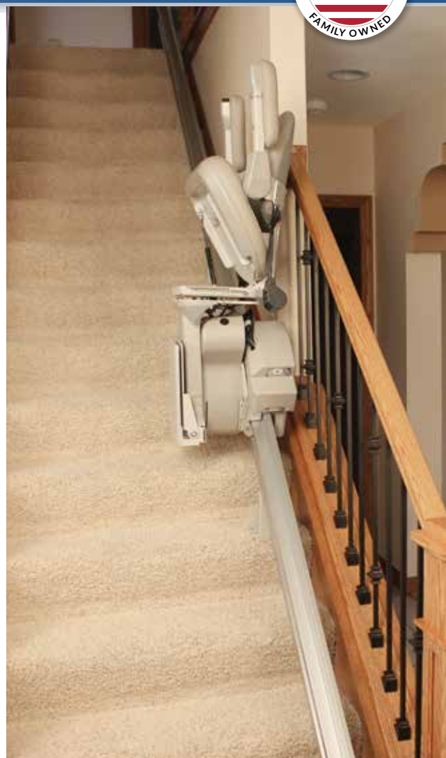
Compact design for open space on stairs.