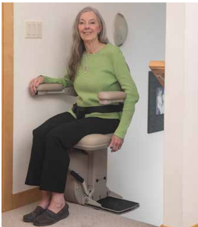
Offset swivel seat makes it easy to get on/off.