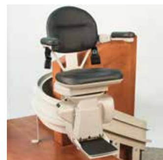
Mid-park and charge station for staircases with middle landings.